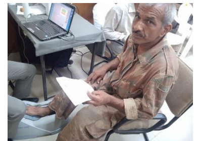
228. 21-07-2023 Bone Mineral Density Test at 505, ABW, Delhi Cantt, New Delhi.