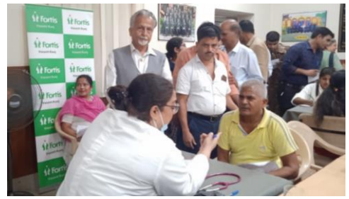
234. 21-07-2023 General Health Test at 505, ABW, Delhi Cantt, New Delhi.