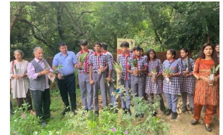
249. 14-08-2023 Tree Plantation at the park of the Kendriya Vidyalaya, JNU, New Delhi.