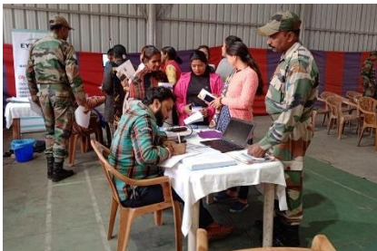
274. 01-12-2023 General Health and BMI Test at Kabul Lines, Delhi Cantt, New Delhi.