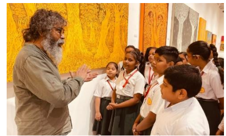
300. 03-05-2024 Art Appreciation Trip #8 at Bikaner House. Pandara Road, India Gate, New Delhi.