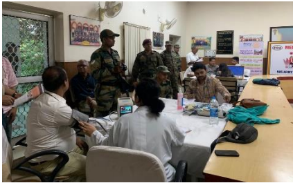
259. 13-10-2023 Cancer Screening Camp at 505 ABW Military Wing Old Family Welfare Center, Delhi Cantt, New Delhi.