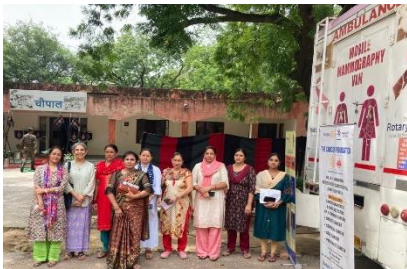
247. 09-08-2023 Camp of Mammography at Rajputana Rifles Regimental Centre, Delhi Cantt., New Delhi.