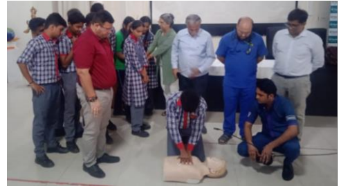
237. 07-08-23 CPR (Cardiopulmonary resuscitation) Demonstration at the Kendriya Vidyalaya, JNU, New Delhi.