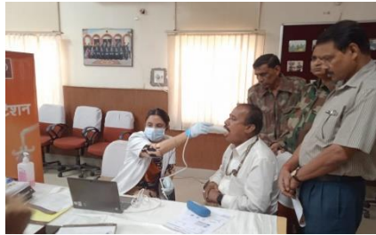
260. 13-10-2023 Dental Check-up Camp at 505 ABW, Delhi Cantt, New Delhi.