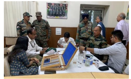
261. 13-10-2023 Health Check-up Camp at 505 ABW, Delhi Cantt, New Delhi.