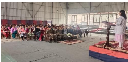
277. 01-12-2023 Health Talk on Cancer Awareness & Detection Camp at Kabul Lines, Delhi Cantt, New Delhi.