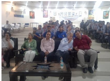
239. 07-08-23 Health Talk on Strong Bones Strong Nation at KV (Kendriya Vidyalaya, JNU, New Delhi.