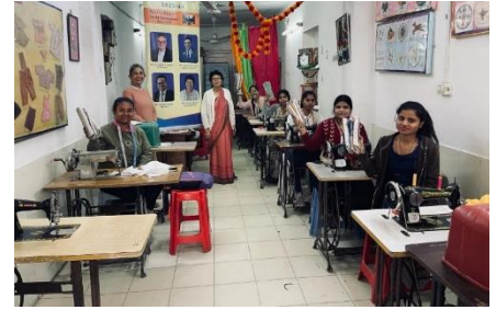
294. 29-02-2024 Distribution of Sanitary Napkins at Usha Tailoring & Embroidery Training Center, Lajpat Bhawan, Lajpat Nagar, New Delhi.