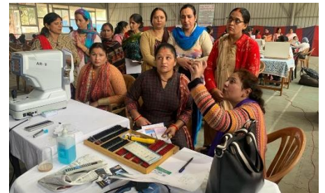
276. 01-12-2023 Eye Check-up at Kabul Lines, Delhi Cantt, New Delhi.