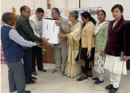
266. 18-11-2023 Dental Check-up Camp at 505, ABW, Delhi Cantt, New Delhi.