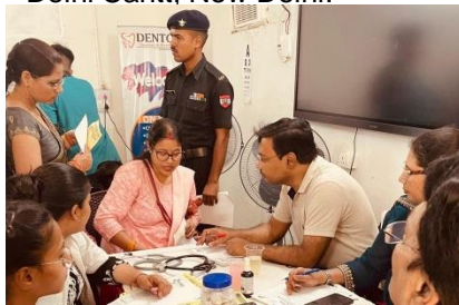
308. 18-05-2024 General Health Test at Unit – Ranvijetas, Near Sadar Bazar Cantt Metro Station, Delhi Cantt, New Delhi.