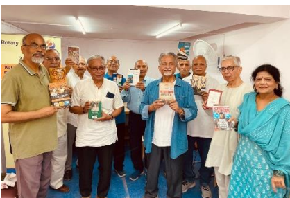
313. 23-06-2024 Rotary Resources Library at B-8, Paryatan Vihar Cooperative Group Housing Society, Vasundhra Enclave, Delhi.