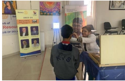
272. 30-11-2023 Eye Check-up Camp at KV (Kendriya Vidyalaya), JNU, New Delhi.