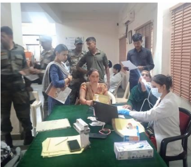
242. 09-08-23 Dental Check-up Camp at Rajputana Rifles Regimental Centre, Delhi Cantt, New Delhi.