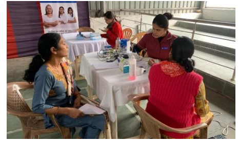
273. 01-12-2023 Early Cancer Detection Camp at Kabul Lines, Delhi Cantt, New Delhi.