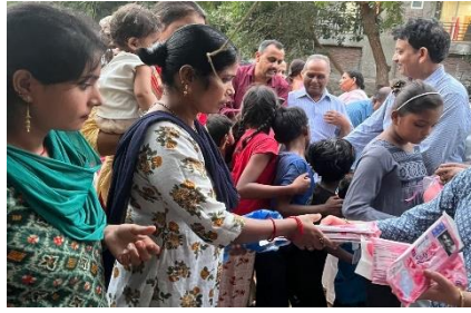
257. 07-10-2023 Distribution of Napkins at B Block Park, Chattarpur Enclave Phase 2, New Delhi.