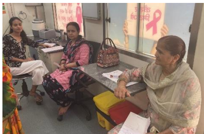
310. 18-05-2024 Mammography Camp at Unit – Ranvijetas, Near Sadar Bazar Cantt Metro Station, Delhi Cantt, New Delhi.