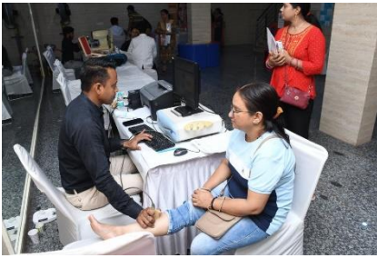
220. 01-07-2023 Bone Mineral Density Test at Makoons Pre School, Chattarpur Enclave Phase 2, New Delhi.