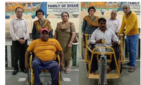
312. 21-06-2024 Distribution of Wheel Chair and Tricycle at C-3, Ram Mandir Janakpuri, New Delhi.