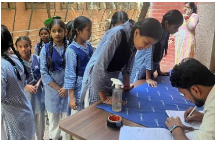
263. 18-10-2023 Eye Check-up Camp at Girls Senior Secondary School, Chattarpur. New Delhi.