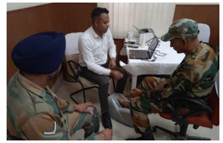
258. 13-10-2023 Bone Mineral Density (BMD) Test at 505, ABW, Delhi Cantt, New Delhi.