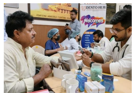
231. 21-07-2023 Health Check-up Camp at 505, ABW, Delhi Cantt, New Delhi.