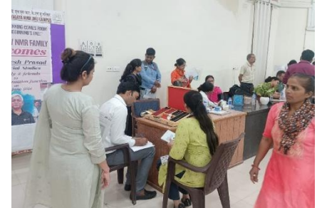
315. 29-06-2024 Health Check-up Camp at KV (Kendriya Vidyalaya), JNU, New Delhi.