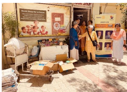
302. 17-05-2024 Raddi & Book Donation at Lajpat Bhawan, Lajpat Nagar, New Delhi.