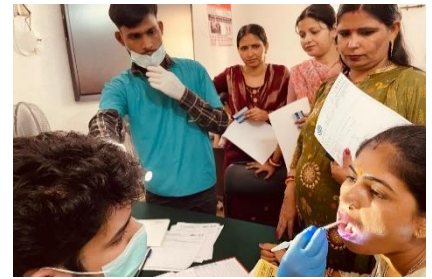
306. 18-05-2024 Dental Check-up Camp at Unit – Ranvijetas, Near Sadar Bazar Cantt Metro Station, Delhi Cantt, New Delhi.