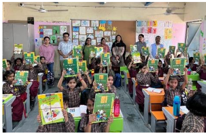
248. 10-08-2023 Distribution of Books at Priya Darshini Govt. Sarvodaya Girls Sr. Secondary School, Fatehpur Beri, New Delhi.