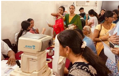
307. 18-05-2024 Eye Check-up Camp at Unit – Ranvijetas, Near Sadar Bazar Cantt Metro Station, Delhi Cantt, New Delhi.