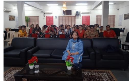
246. 09-08-2023 Health Talk on Cancer Awareness & Detection Camp at Rajputana Rifles Regimental Centre, Delhi Cantt., New Delhi.