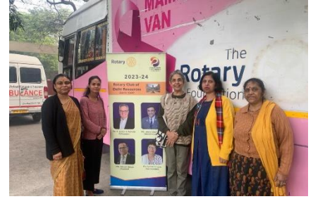
270. 30-11-2023 Mammography Camp at KV (Kendriya Vidyalaya), JNU, New Delhi.