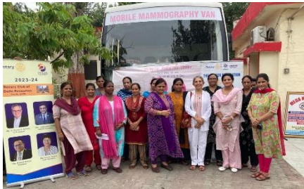
235. 22-07-23 Camp of Mammography at Delhi Cantt, New Delhi.