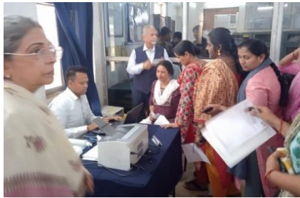
305. 18-05-2024 Bone Mineral Density (BMD) at Unit – Ranvijetas, Near Sadar Bazar Cantt Metro Station, Delhi Cantt, New Delhi.