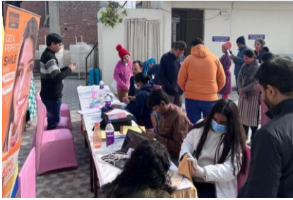
292. 14-01-2024 General Health Test at Chattarpur Enclave, New Delhi.