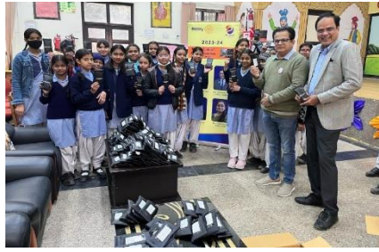
293. 31-01-2024 Distribution of Eyeglasses at Senior Girls Secondary School, Chattarpur, New Delhi.