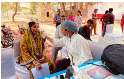
298. 16-03-2024 Dental Check-up Camp at B – Block Park, Chattarpur Enclave Phase – 2, New Delhi.