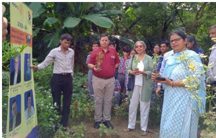
238. 07-08-23 Tree planted at the park of the Kendriya Vidyalaya, JNU, New Delhi.