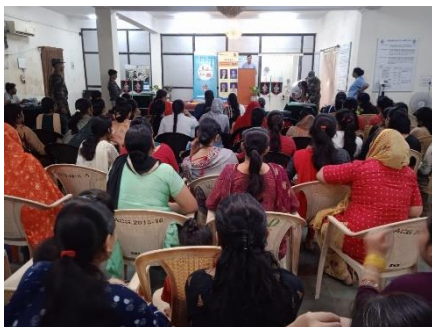
241. 09-08-23 CPR (Cardiopulmonary Resuscitation) Camp at Rajputana Rifles Regimental Centre, Delhi Cantt, New Delhi.