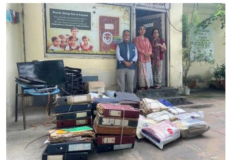
255. 22-09-2023 'Book Shop for a Cause', at Lajpat Bhawan, Lajpat Nagar, New Delhi.