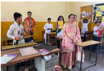
250. 14-08-2023 Distribution of Books at Rattan Chand Arya Public School, Sarojini Nagar, New Delhi.