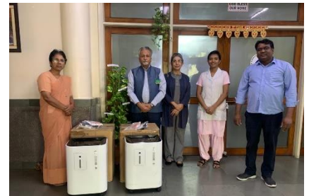
264. 13-11-2023 Handed over two Oxygen Concentrators to Shanti Avedna Sadan (SAS), Near Safdarjung Hospital, New Delhi.