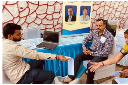
296. 16-03-2024 Bone Mineral Density (BMD) Test at B –Block Park, Chattarpur Enclave Phase – 2, New Delhi.