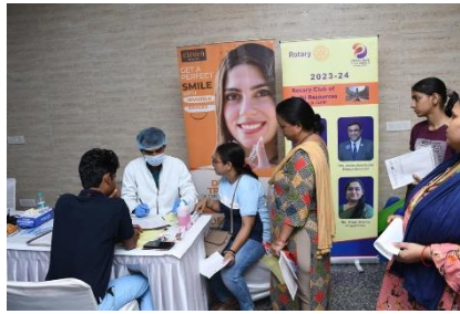
221. 01-07-2023 Dental Check-up Camp at Makoons Pre School, Chattarpur Enclave Phase 2, New Delhi.