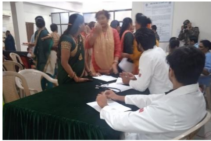
245. 09-08-2023 General Health and BMI Test at Rajputana Rifles Regimental Centre, Delhi Cantt., New Delhi.