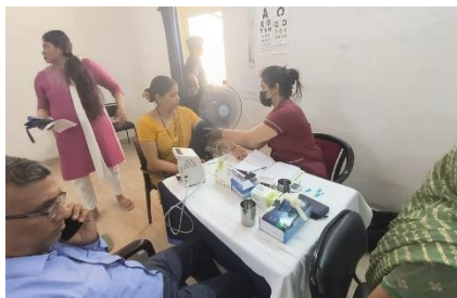
311. 18-05-2024 Cancer Screening Camp at Unit – Ranvijetas, Near Sadar Bazar Cantt Metro Station, Delhi Cantt, New Delhi.