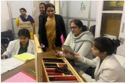
271. 30-11-2023 Health Check-up Camp at KV, JNU, New Delhi.