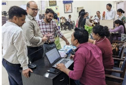
314. 29-06-2024 Cancer Screening Camp at KV, JNU, New Delhi.