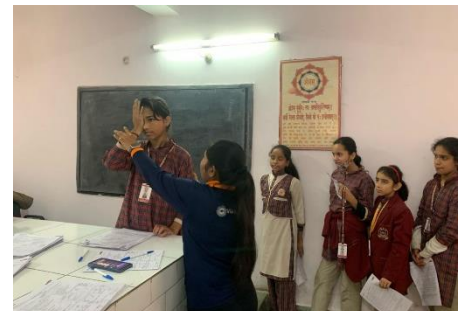
279. 01-12-2023 Eye Check-up Camp at DAV Public School, Kailash Hill, New Delhi.