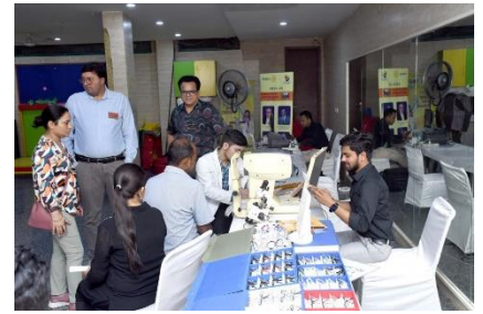
222. 01-07-2023 Eye Check-up Camp at Makoons Pre School, Chattarpur Enclave Phase 2, New Delhi.