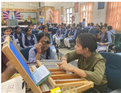
253. 15 & 16-09-2023 Eye Check-up Camp at Govt Girls Sr. Secondary School, Chattarpur, New Delhi.