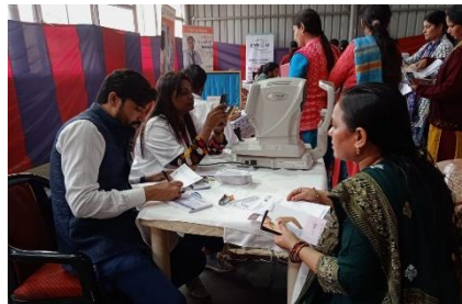
275. 01-12-2023 Dental Check-up Camp at Kabul Lines, Delhi Cantt, New Delhi.