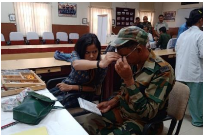
262. 13-10-2023 Eye Check-up at 505 ABW Military Wing Old Family Welfare Center, Delhi Cantt, New Delhi.