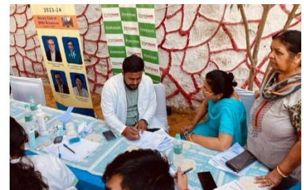
297. 16-03-2024 General Health Test at B – Block Park, Chattarpur Enclave Phase 2, New Delhi.