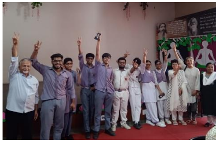
224. 05-07-2023 Distributed 129 Specs at GLT Saraswati Bal Mandir Senior Secondary School, Nehru Nagar, New Delhi.