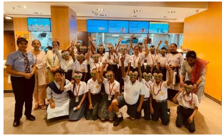
299. 03-05-2024 Year-end Treat - Students of R C Arya Public School of Sarojini Nagar relished the Breakfast at McDonald's at Janpath New Delhi.