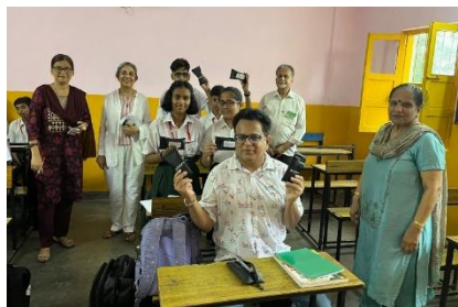
227. 13-07-2023 Distributed 50 Specs at Rattan Chand Arya Public School, Sarojini Nagar, New Delhi.