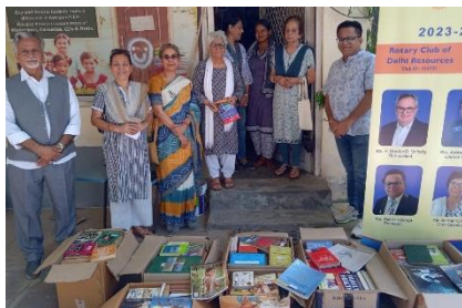
251. 04-09-2023 'Book Shop for a Cause', at Lajpat Bhawan, Lajpat Nagar, New Delhi.