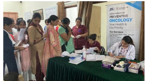
240. 09-08-23 Cancer Screening Camp at Rajputana Rifles Regimental Centre, Delhi Cantt, New Delhi.