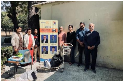
295. 29-02-2024 Donation of Note Books, Raddi & E Waste to Book Shop for a Cause' at Lajpat Bhawan, Lajpat Nagar, New Delhi.