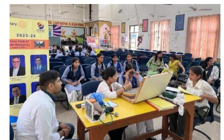
252. 13-09-2023 Eye Check-up Camp at Government Girls Senior Secondary School, Chattarpur, New Delhi.