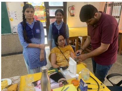
254. 15 & 16-09-2023 Health Check-up Camp at Govt Girls Senior Secondary School, Chattarpur, New Delhi.