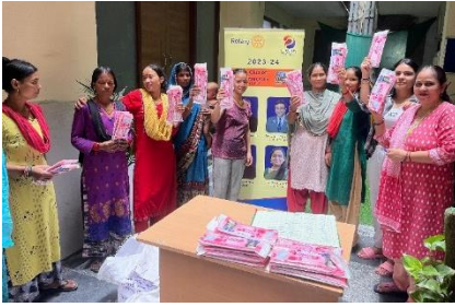
256. 23-09-2023 Distribution of Sanitary Napkins at Makoons Pre School, Chattarpur Enclave Phase 2, New Delhi.