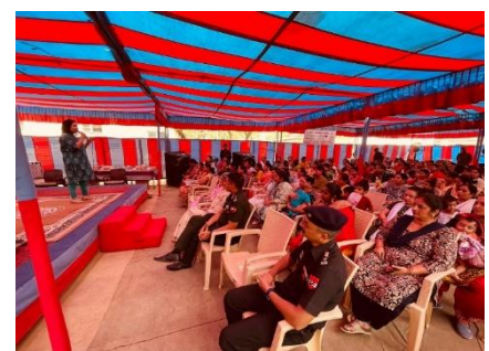
303. 18-05-2024 Keynote Address on Preventive Oncology at Unit – Ranvijetas, Delhi Cantt, New Delhi.