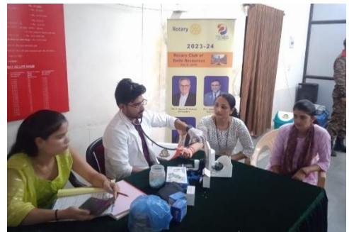
243. 09-08-23 Health Check-up Camp at Rajputana Rifles Regimental Centre, Delhi Cantt, New Delhi.