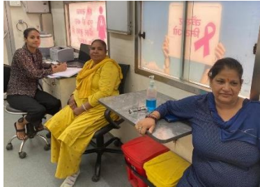
236. 25-07-23 Camp of Mammography at Delhi Cantt, New Delhi.