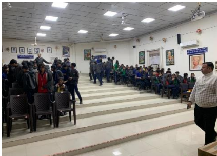
265. 18-11-2023 Talk on Thalassemia at KV, JNU, New Delhi.