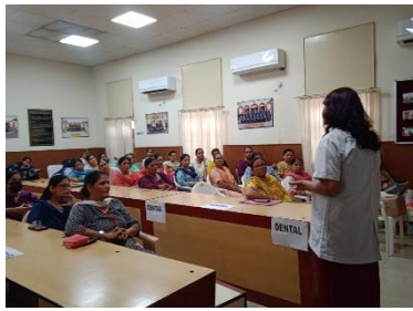
233. 21-07-2023 Cancer Awareness & Detection Camp at 505, ABW, Delhi Cantt, New Delhi.