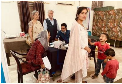
304. 18-05-2024 Bone Mineral Density Test at Makoons Pre School, Chattarpur Enclave Phase 2, New Delhi.