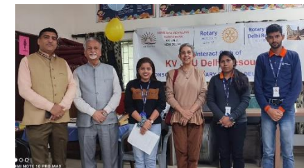
267. 24-11-2023 Eye Check-up Camp at KV (Kendriya Vidyalaya), IIT (under KV JNU), New Delhi.