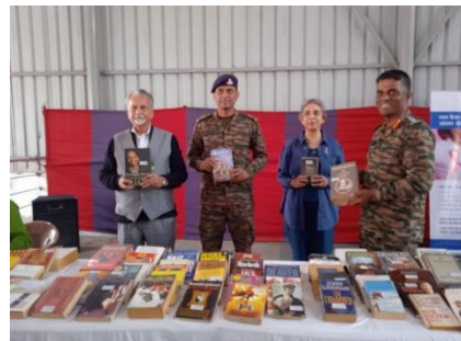
278. 01-12-2023 Rotary Resources Library at Kabul Lines, Delhi Cantt, New Delhi.