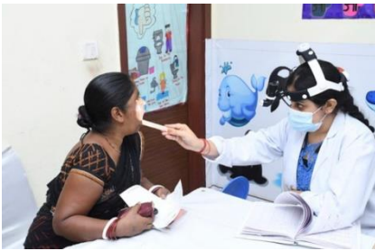
223. 01-07-2023 Cancer Detection Camp at Makoons Pre School, Chattarpur Enclave Phase 2, New Delhi.