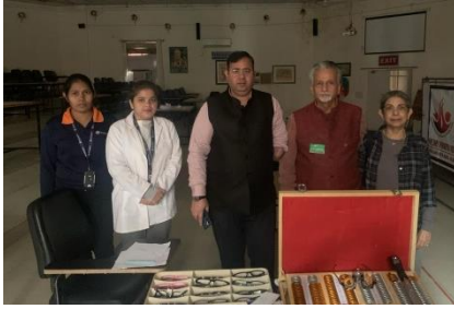
268. 28-11-2023 Eye Check-up Camp at KV (Kendriya Vidyalaya), JNU, New Delhi.