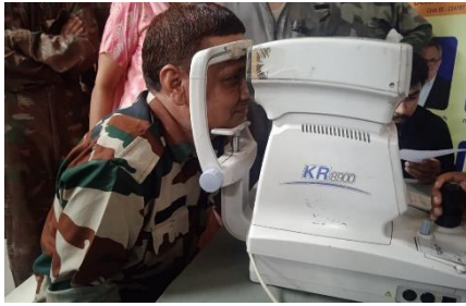
232. 21-07-2023 Eye Check-up Camp at 505, ABW, Delhi Cantt., New Delhi.