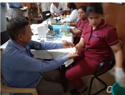
229. 21-07-2023 Cancer Screening Camp, at 505, ABW, Delhi Cantt, New Delhi.