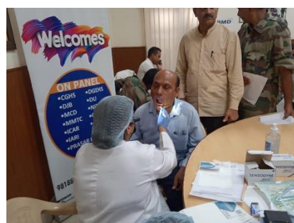
230. 21-07-2023 Dental Check-up Camp at 505, ABW, Delhi Cantt, New Delhi.