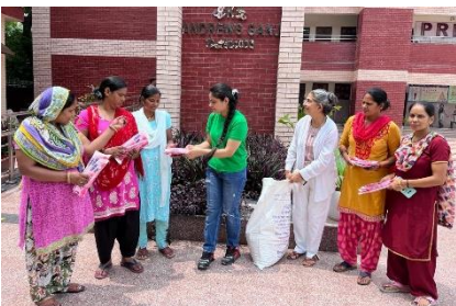
226. 13-07-2023 Distributed 30 packets of Sanitary Napkins at SKV, Andrews Ganj, New Delhi.