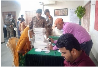
244. 09-08-2023 Eye Check-up Camp at Rajputana Rifles Regimental Centre, Delhi Cantt., New Delhi.