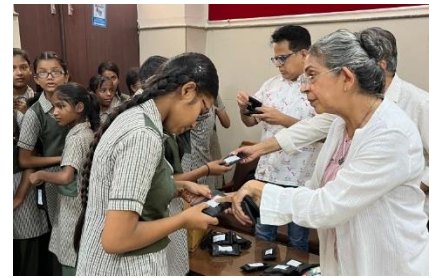
225. 13-07-2023 Distributed 50 Specs at, SKV, Andrews Ganj, New Delhi.